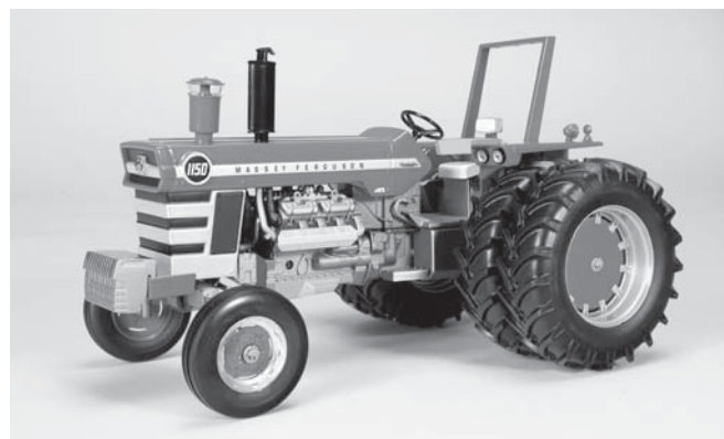
Custom tractors, like this high detail 1/16 scale Massey Ferguson 1150 V-8 Power Tractor, are another popular category of collectible among farm toy collectors. The tractor is the 2014 Toy Tractor Times Anniversary Tractor, and is available at www.toytractortimes.com. Each year the group issues a new tractor, and the 2015 model will be announced in March.