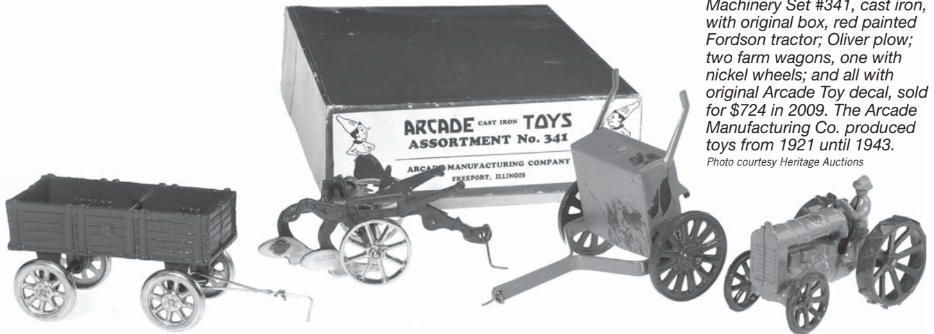
◀ Arcade Four Piece Farm Machinery Set #341, cast iron, with original box, red painted Fordson tractor; Oliver plow; two farm wagons, one with nickel wheels; and all with original Arcade Toy decal, sold for $724 in 2009. The Arcade Manufacturing Co. produced toys from 1921 until 1943.